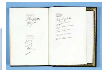
Treaty of Peace with Japan in 1951